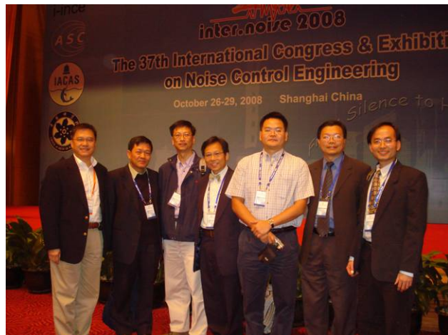
Some of HKIOA's delegation at Opening ceremony