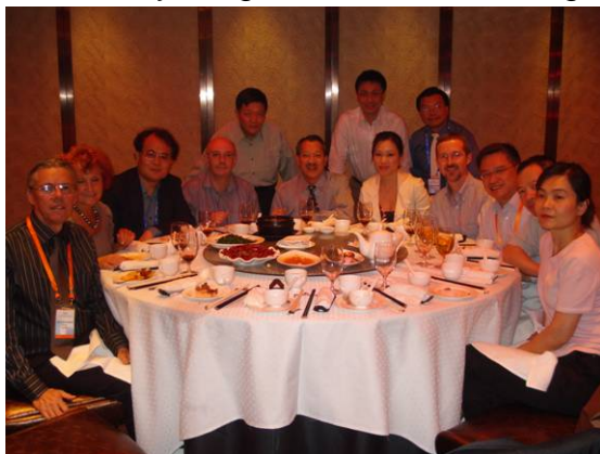
Dinner with guests