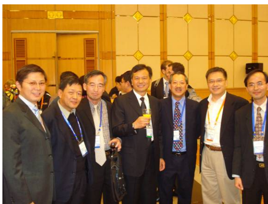
The Reception Party

delegates refreshed the acquaintances, making new friends etc in the Welcoming Reception.