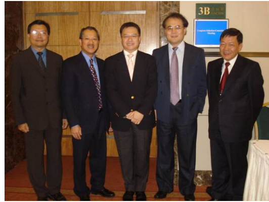
The magnificent 5 after the presentation of HKIOA's proposal

and responded to the questions raised by the Congress Selection Committee of I-INCE. Our presentation and proposal were well received. Because of the excellence of both proposals, the I-INCE needed time to discuss before decision could be made. At this writing, we are yet to receive the result.