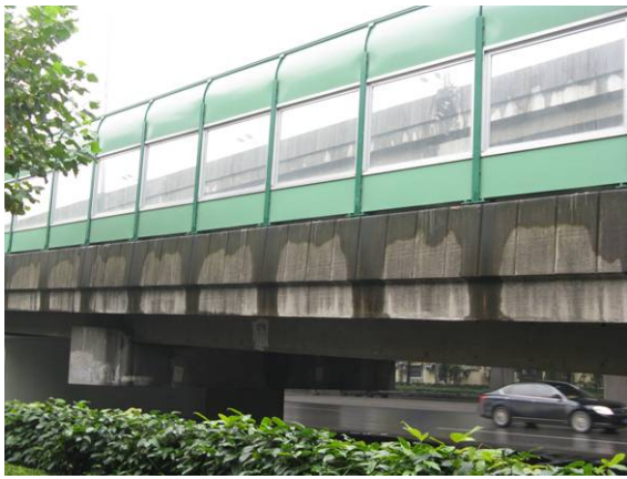
Noise barriers on a flyover along Yan'an Rd West in Hongqiao