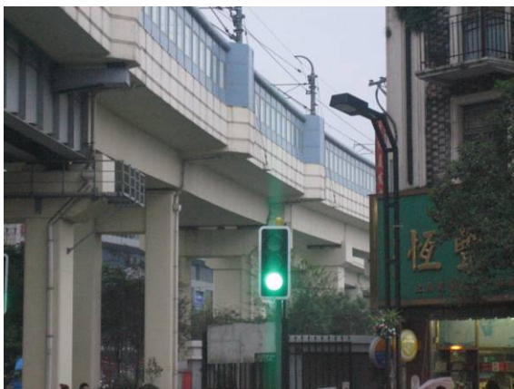
Noise barriers along the elevated Shanghai Metro at Hongkou