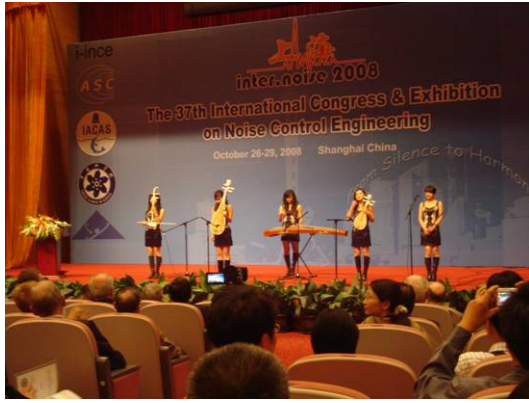
Music performance at Opening ceremony

control congress. In the last AGM in March 2008, the general views of members were also supportive of encouraging members to attend the Inter-Noise 2008. On this, the HKIOA Committee decided to sponsor a limited number of members to attend this congress by sponsoring half of the