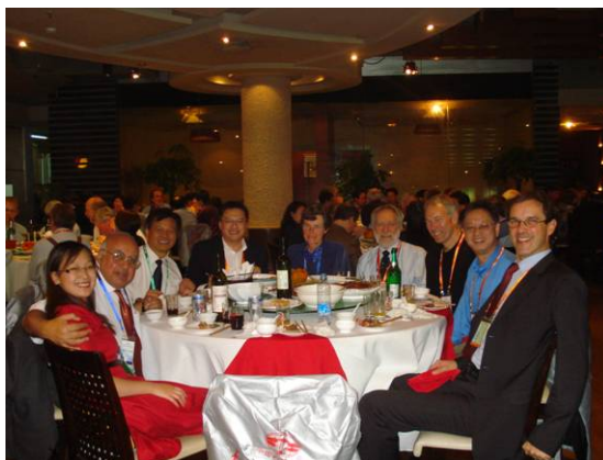
The Chairman’s Dinner