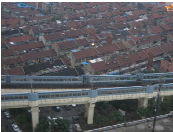
A bird's view of the elevated railway section with vertical barriers protecting low rises