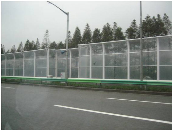
Noise barriers along Huazhou Rd on the way to Pudong Airport