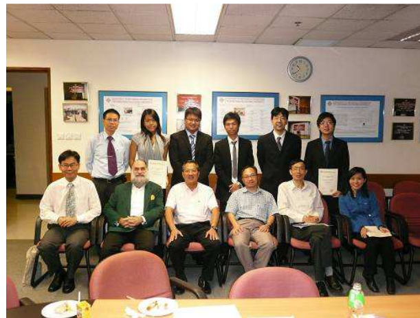
Assessors and the candidates