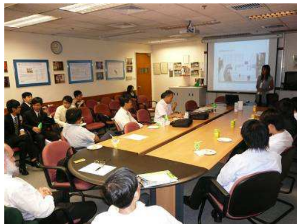
Oral presentation by shortlisted candidates

We warmly congratulate all the candidates for their excellent work and for their participation in this year's event.