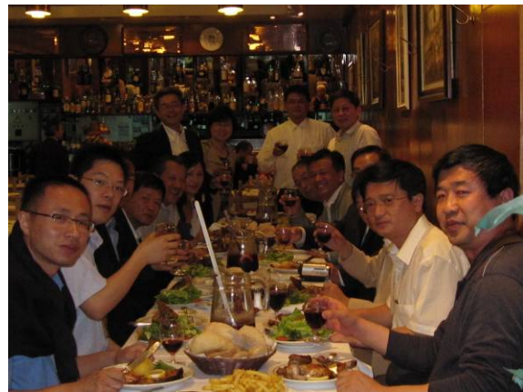
Delegates from China, PRC and Hong Kong gathered together.