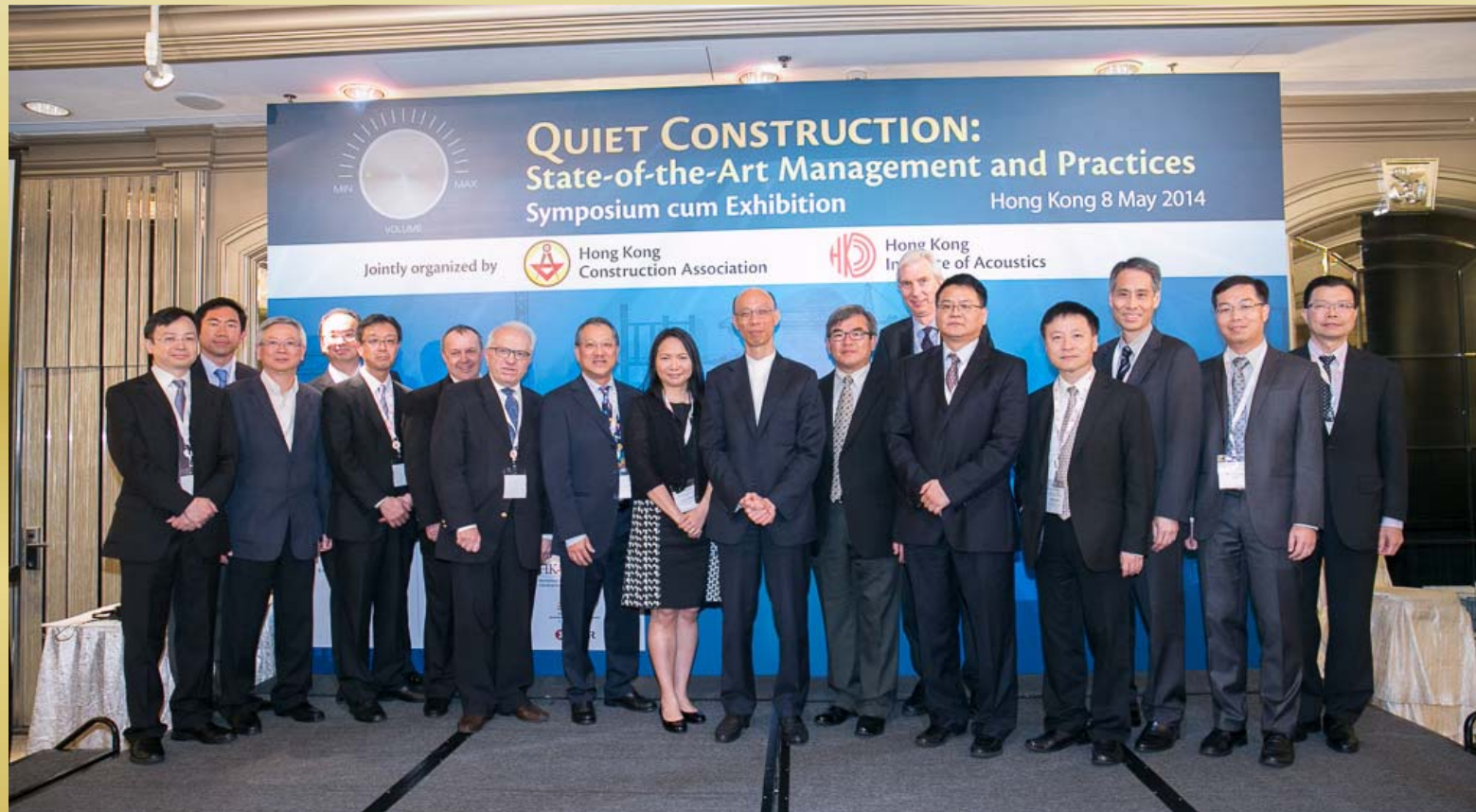
Group photo of key speakers and symposium organising committee