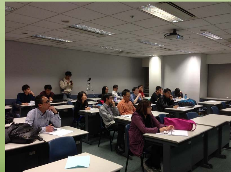
Encouraging response from participants