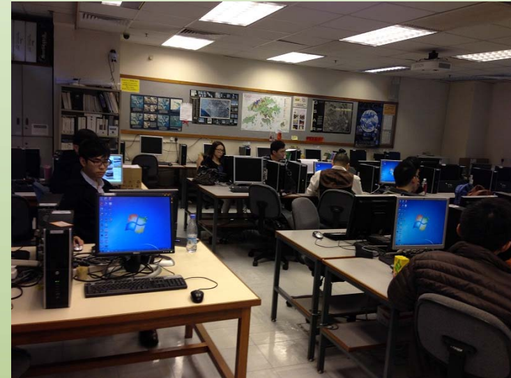
Road traffic modeling session at CUHK