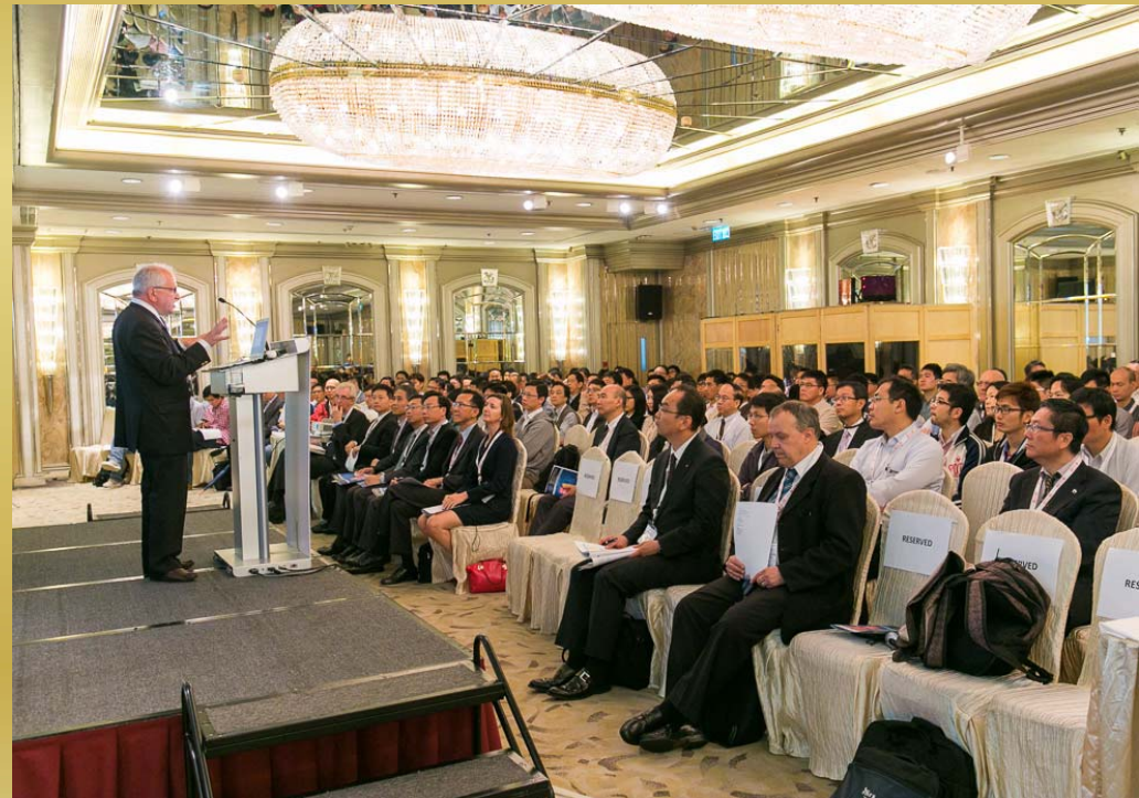
The Symposium Cum Exhibition "Quiet Construction: State-of-the-Art Management & Practices" at Regal Hong Kong Hotel