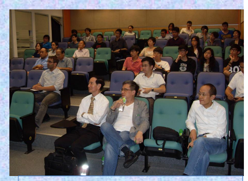
Participants showed great interest in the talks.

Overall, the seminar provided an excellent opportunity to share with members the current road traffic noise mitigation measures adopted in Hong Kong and the new web-based platform on "Innovative Noise Mitigation Designs and Measures". The seminar was well received by over 30 participants.